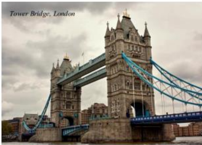
Tower Bridge, London